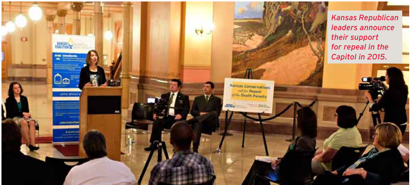
Kansas Republican leaders announce their support for repeal in the Capitol in 2015.