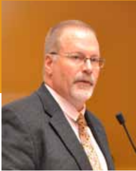
KirstenFrankly, Wikimedia Commons.CC-BY-SA-4.0