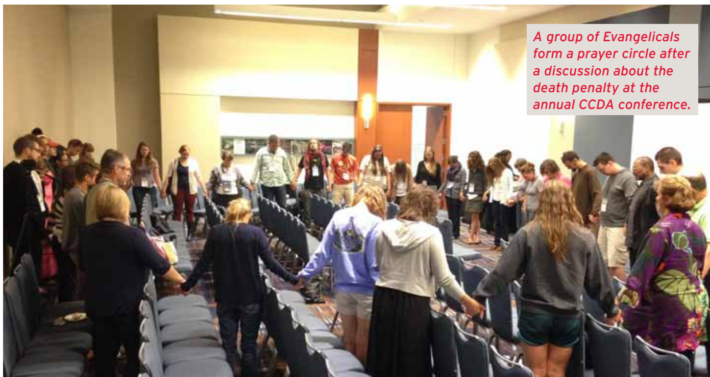
A group of Evangelicals form a prayer circle after a discussion about the death penalty at the annual CCDA conference.

It would have been difficult a decade ago to find many Evangelicals openly questioning the death penalty. Today, they are standing up in ever growing numbers.